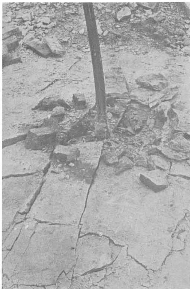
Fig. 2. — Failure volume induced at anchor 4, showing the control of the dominant NW-SE joints.

Bearing in mind the high grout strengths measured prior to the stressing of each anchor ( > 35 \text{ N/mm}^2 ) no correspondence between ultimate average grout-tendon bond values and grout strength was detected. The presence of surcharge grout (up to 9 m) did not markedly affect grout-tendon bond values (table 3) or the phenomenon of debonding. A grout surcharge in excess of 3 m did however lead to a steady and quieter pull-out of strands compared with the sudden explosive type of failure which may be observed without surcharge.